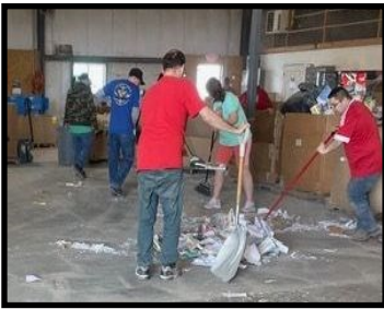
Sunflower individuals tidy up in their recycling operation.

Manufacturing-plant contracts also result in attractive job opportunities. "For example," Mandy noted, "we have much-appreciated contracts with Flame Engineering and Redbarn. Plant employees also lend a helping hand to the recycling operation, in addition to performing tasks such as assembly and packaging."