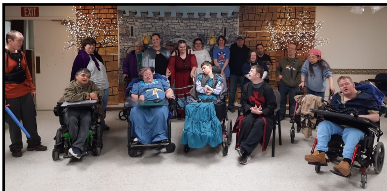
Staff and individuals served take time to pose for a group picture in front of the themed backdrop during Sunflower's Renaissance Fair.